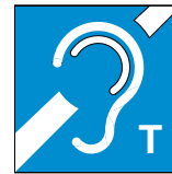
IEC Symbol for Audio Frequency Induction Loop Systems (AFILS)

Good bye ALDACon 2009 and see you next year.