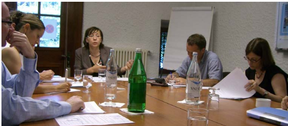
IDA donors meeting in Geneva

From the 27-28 th of February the IFHOH Board will meet in Stockholm. There we will discuss and prepare for the IFHOH BGM in Stockholm 18-20 th of June 2010. I hope that I will see many of you in Stockholm next year.