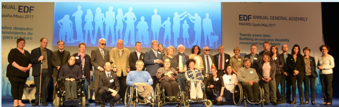
EDF Board elected at its Annual General Assembly in Madrid, Spain in May, 2017

The EU Disability Card is a pilot project managed by the European Commission in eight EU countries. It aims to develop a card that is recognised across borders and gives access to benefits mainly in the areas of culture, leisure, sport and transport. As the pilot project comes to an end, the EDF has designed a survey to gather the experiences of those who have the Card, but also of persons with disabilities that would like to get the card in their countries. The questionnaire takes around five minutes to complete. The EDF will use the results to prepare a report and recommendations to the EU Commission. Read more