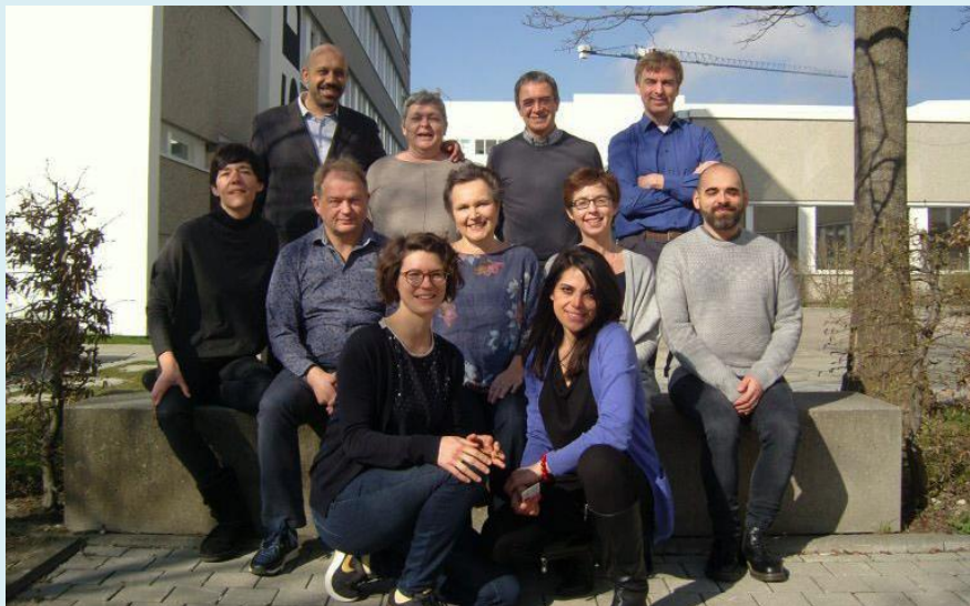
The LTA Team

For more information, see the LiveTextAccess website: http://ltaproject.eu .