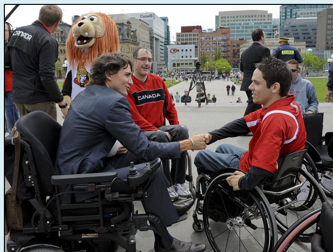
Prime Minister Justin Trudeau with disability advocates on Parliament Hill, Ottawa

The Canadian government passed Bill C-81: An Accessible Canada Act in May 2019. Previously accessibility was provided a bit everywhere in legislation and a framework for protecting these rights was provided through the Canadian Human Rights Act . The new law provides a more centralized focus on creating communities, workplaces and services that enable all persons to participate fully. For more info: https://siteimprove.com/en-ca/accessibility/accessible-canada-act/ .