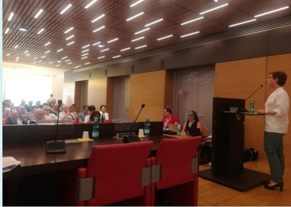
Rocío Bernabé Caro presenting at Intersteno Conference

The LTA Team was also at the Intersteno Conference in Cagliari on July 16, 2019 to discuss curriculum design and how to make it accessible for professionals.